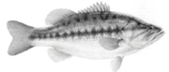
Florida & Native Black Bass

Located near Cooper, TX, our ponds are HEAVILY stocked with: